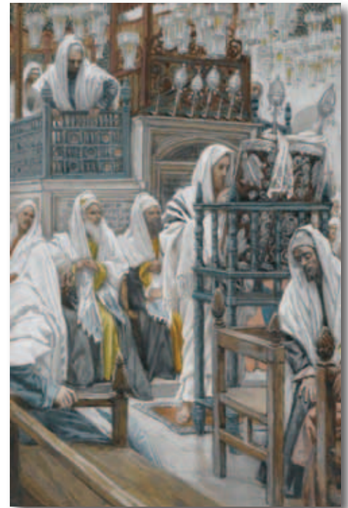
Yeshua speaks with the elders in the Temple and reads the Torah scroll in the synagogue.