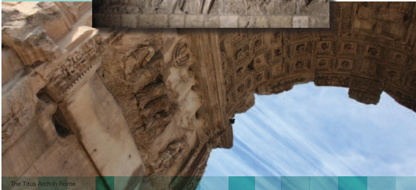
The Titus Arch in Rome

His instructions to Noah and Moses were incredibly detailed, including dimensions, materials needed, colors, etc. God gave Moses not only directions on dimensions, but also on the beautification of the edifice. God even designed the clothing the priests were to wear. He told Moses and the craftsmen how they were to be made. God was vitally involved in every stage of the building process.