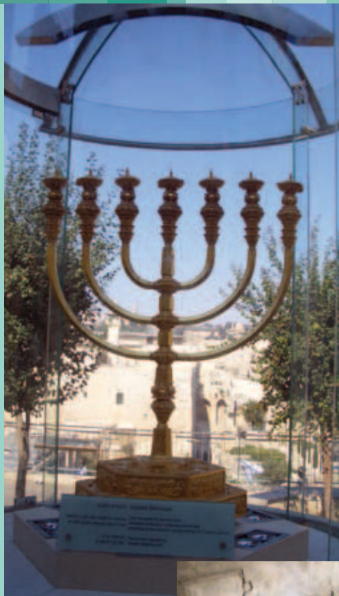
The Menorah near the Kotel