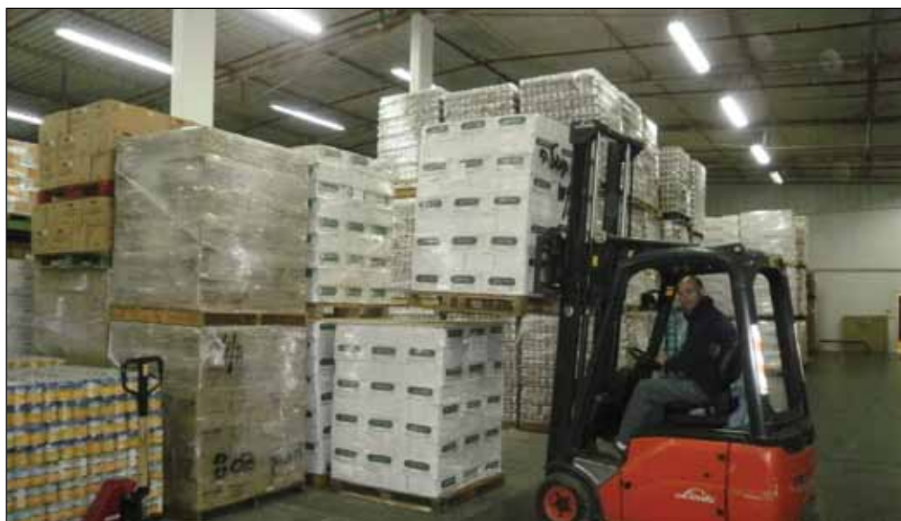
Bridges for Peace food stored for times of crisis