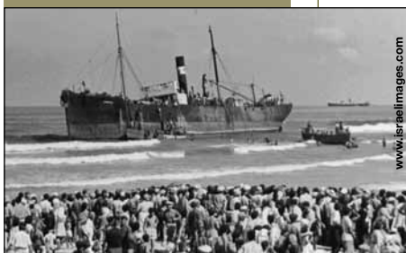
Immigrant ship at Tel Aviv coast, 1939