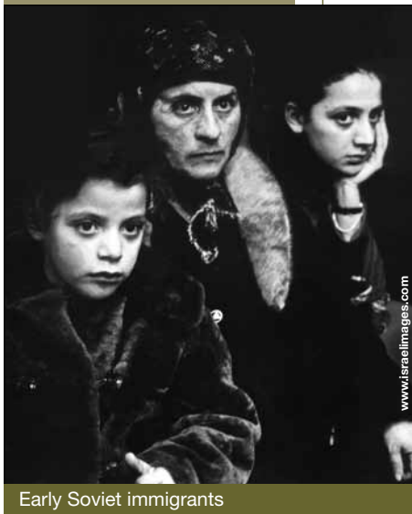
Early Soviet immigrants