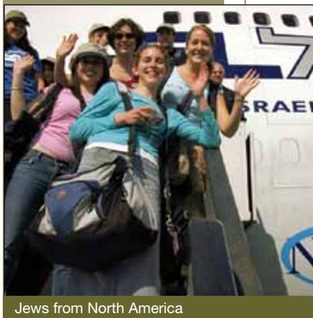
Jews from North America

Colonel C. R. Condor wrote in 1877 that "Palestine is empty. The population is not large enough to till the land."