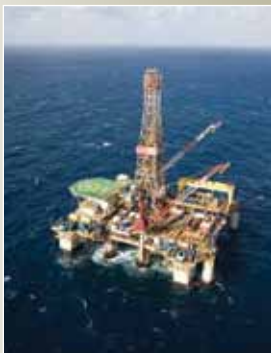
Oil discovery in Israel