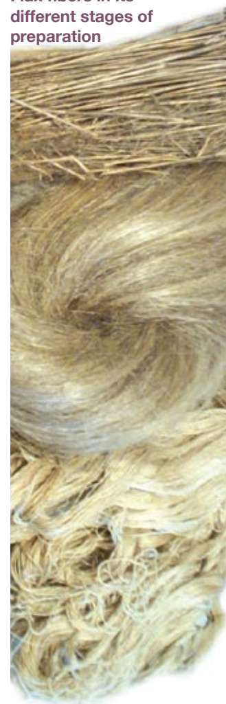
Flax fibers in its different stages of preparation

Linen, for believers, represents “the righteous acts of the saints.”