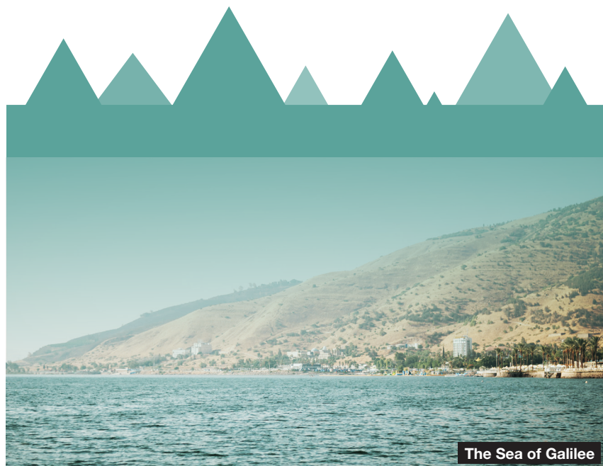
The Sea of Galilee

“To proclaim the acceptable year of the LORD, and the day of vengeance of our God; to comfort all who mourn, to console those who mourn in Zion, to give them beauty for ashes, the oil of joy for mourning” (Isa.61:2–3a).