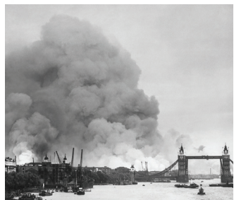
Smoke rising from London after an air raid during the Blitz in World War II

On October 7, 2023, the unimaginable happened. An evil was unleashed as thousands of Hamas terrorists—under a barrage of 4,300 missiles—penetrated deep into Israel and committed barbaric acts on everyone they encountered. Apart from kidnapping over 250 Israelis, none were spared. Young and old were butchered and tortured. Like wolves, Hamas looked for helpless, weak victims. Israeli security squads and soldiers, who raced to the south fought heroically as the nation soon repulsed the invaders.