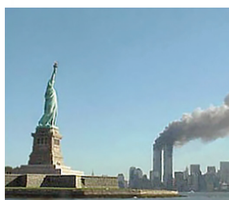
The attack on the World Trade Center in New York