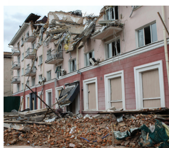
A hotel in Ukraine destroyed by a Russian bomb