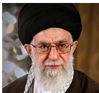
Ayatollah Sayyid Ali Khamenei