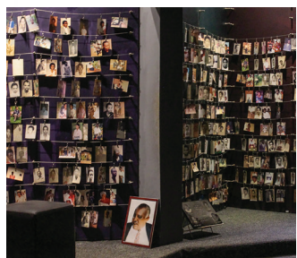
Genocide Memorial, Rwanda